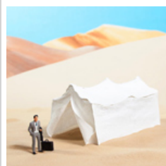
'A Hologram for the King,' by Dave Eggers