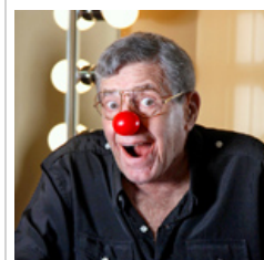
Theater Novice at 86? What a Nutty Idea

Home | World | U.S. | N.Y. / Region | Business | Technology | Science | Health | Sports | Opinion | Arts | Style | Travel | Jobs | Real Estate | Autos | Site Map