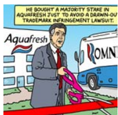
The Strip: Mitt's Financial Fiction